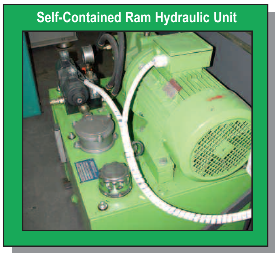
Self-Contained Ram Hydraulic Unit